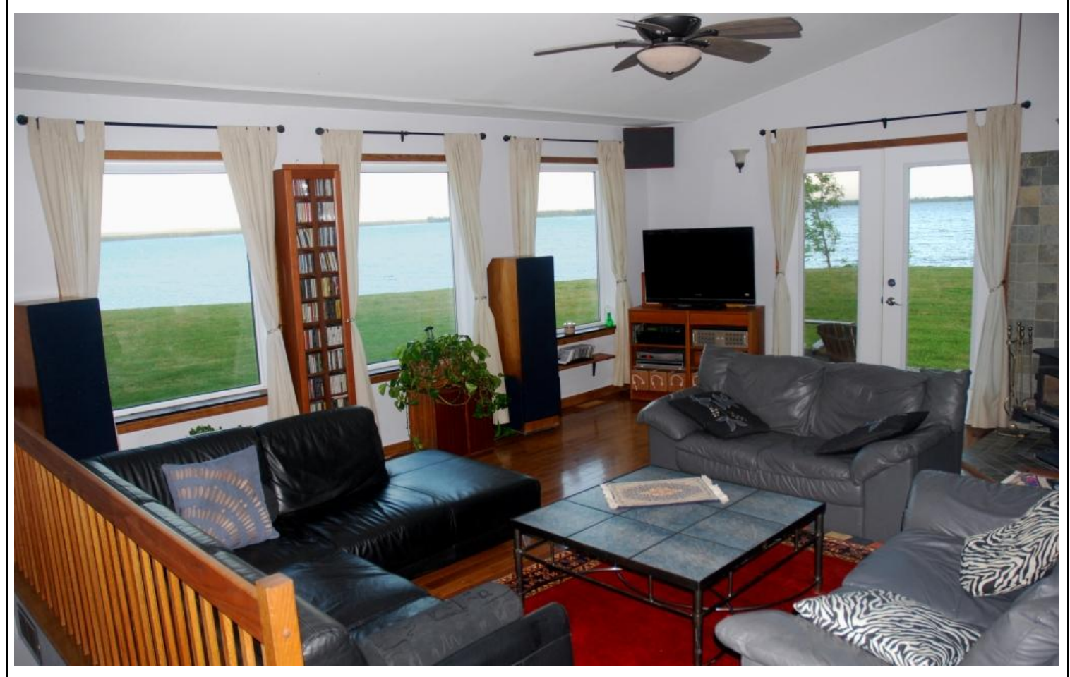
Main living room, entrance and wood stove

Designed by a talented local architect (Sonia Martel, Iberville, Qc), and built by professional contractors throughout, to the highest quality and insulation standards, this 4-seasons split-level cottage provides all modern amenities, and the same spectacular lake views can be enjoyed from most rooms in the house: