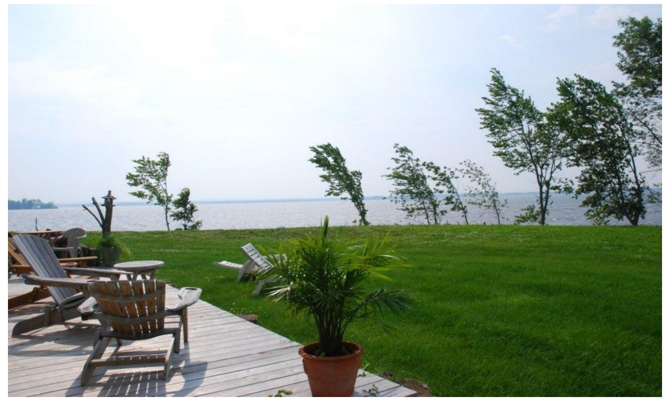
On a spring day, view from the south deck of the house

The house has stunning unobstructed views of the lake and the mountains of Vermont, with mature trees mostly on the sides and back of the property: